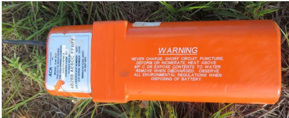
Figure 12: ELT unit as it was found at the accident site.

1.18.2 The ZS-STD was not fitted with an ELT.