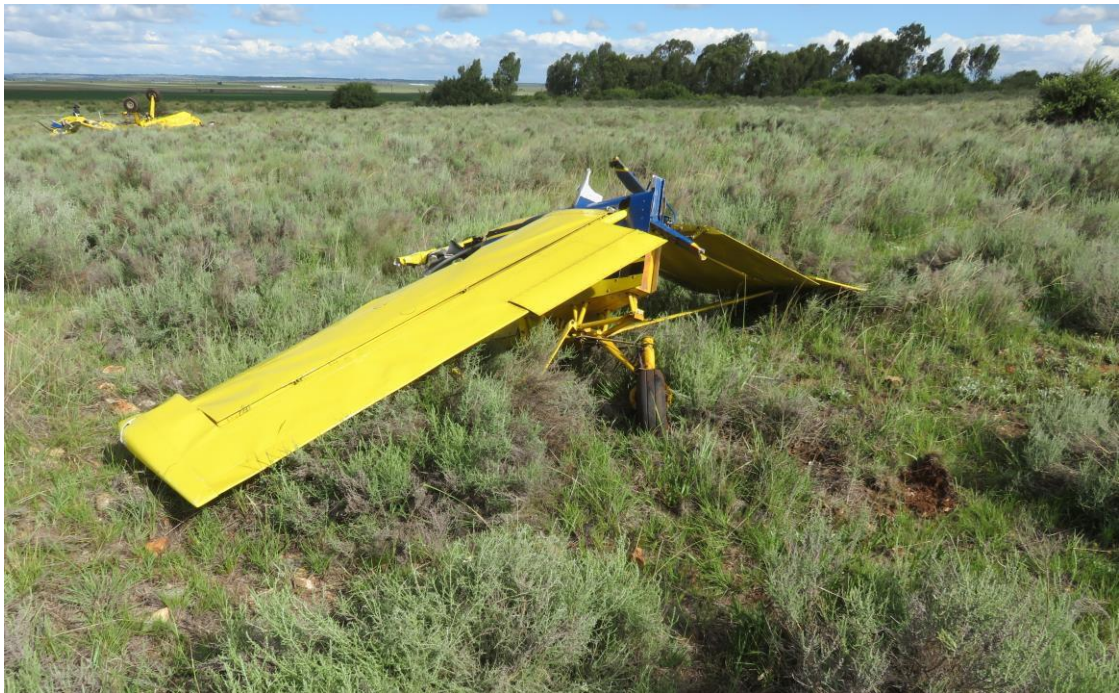
Figure 10: The aft fuselage and empennage with the two horizontal stabilisers still attached.