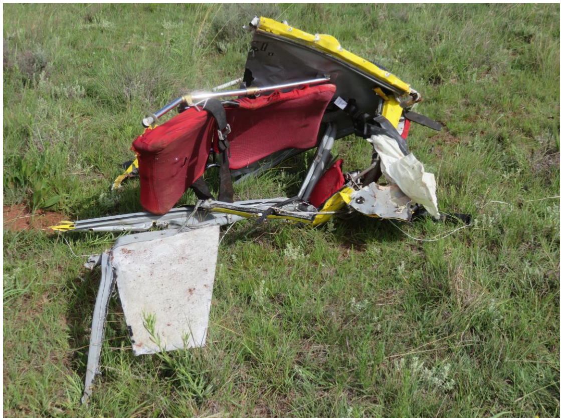
Figure 11: The pilot seat and floor structure of ZS-XPC.