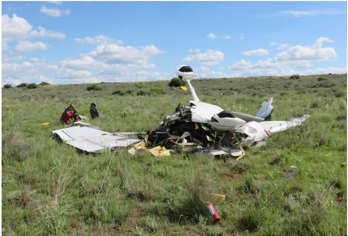
Figure 5: The main wreckage of ZS-STD.