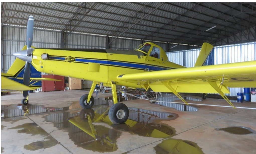
Figure 2: The ZS-XPC aircraft.