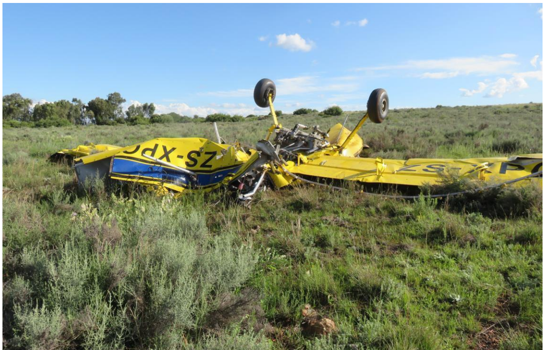
Figure 7: The main wreckage of ZS-XPC.