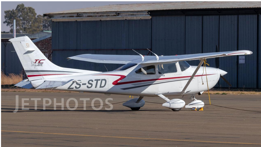
Figure 1: The ZS-STD aircraft.

Accident - Preliminary Report - AIID Ref No: CA18/2/3/10407