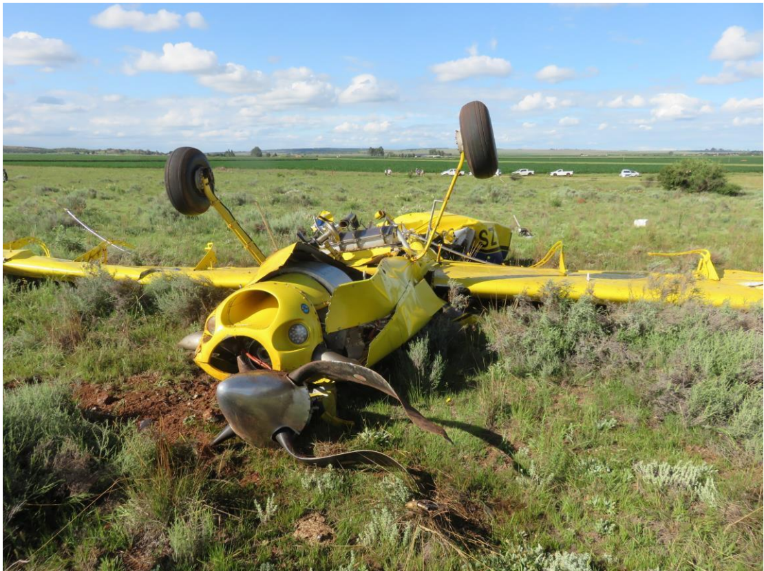
Figure 8: Deformed propeller blades, with one broken off.