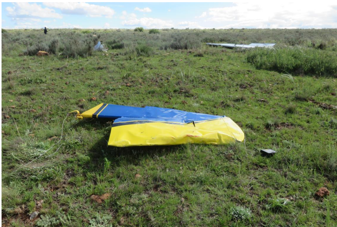
Figure 9: The vertical stabiliser and rudder assembly near the left wing of ZS-STD.