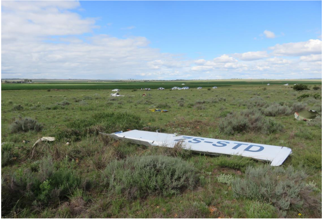
Figure 6: The left wing of ZS-STD.