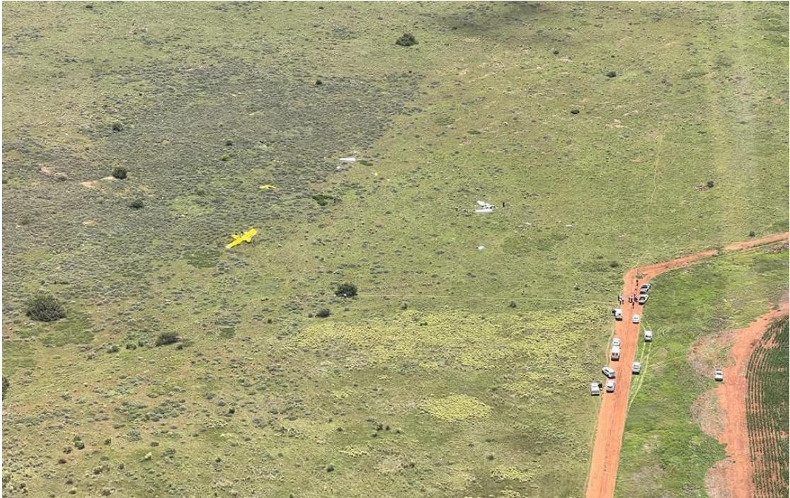
Figure 4: An aerial view of the accident site.